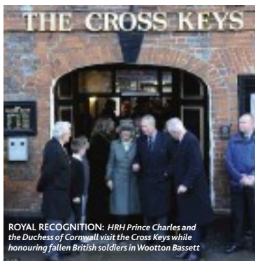
ROYAL RECOGNITION: HRH Prince Charles and the Duchess of Cornwall visit the Cross Keys while honouring fallen British soldiers in Wootton Bassett

For the last two years, staff at the Cross Keys in Wootton Bassett have dedicated themselves to serving not only their local community, but also the families of fallen British soldiers from all over the UK – without any agenda other than to simply 'do their bit'.